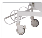
Oxygen Cylinder Cage