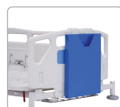
Moulded Chart Holder