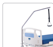
Stainless Steel Lifting Pole