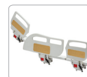
3rd Set of Safety Side Railings