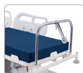
Orthopaedic Traction Pulley